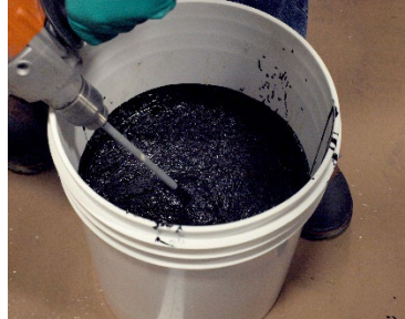
Mix all parts for approximately 25-30 seconds until thoroughly blended. Do not over-mix.