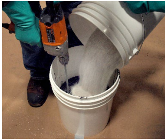
Add Part C aggregate to the mixed units of Part A and Part B.