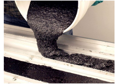
Pour contents out into your forms.